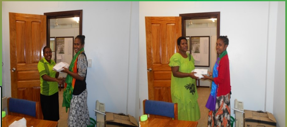
Presentation of gifts to the students