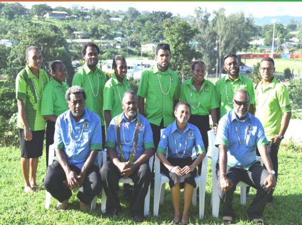
Corporate Services Unit team with their new uniforms