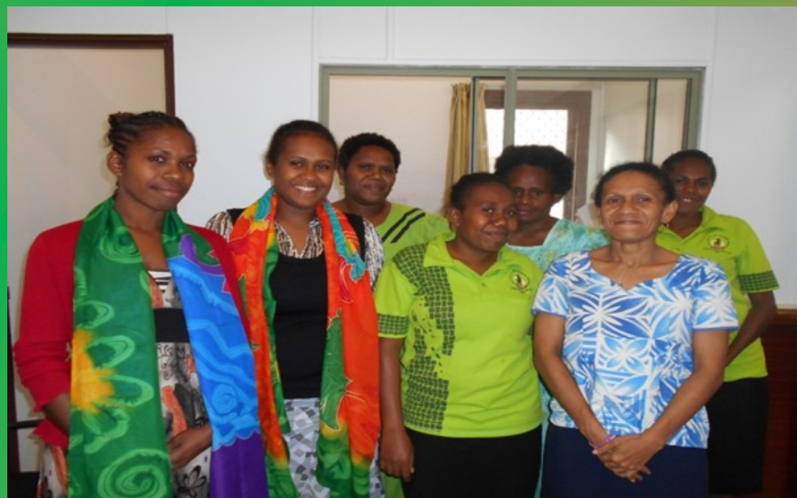
Group photo with the students before they leave

"Only practical work and experience lead the young to maturity." Maria Montessori