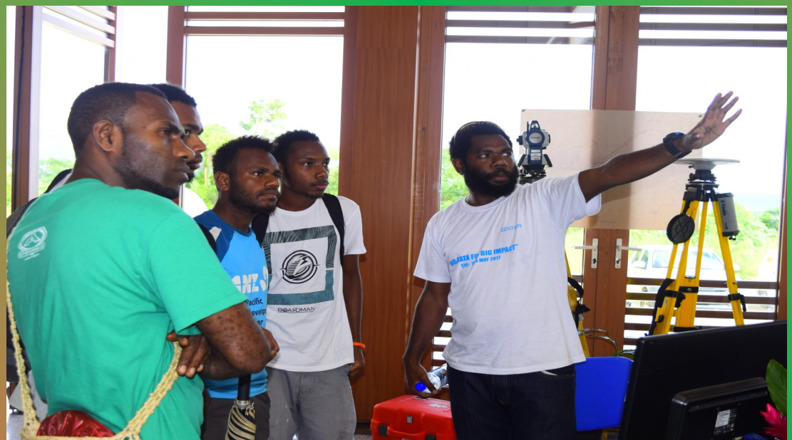
Land Surveyor explain his work to students who came to visit MoL&NR booths.

"It is not what technology does to us, it is what we do to technology. Get smart with technology, choose wisely and use it in a way that benefits both you and those around you." Anonymous