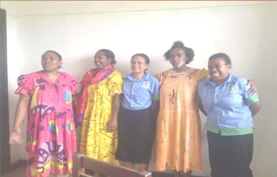
Group photo with the students before they leave