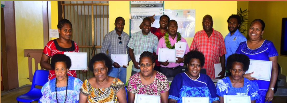
The participants and their certificates