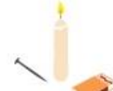
Nil, Kandel, Matjes