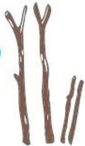
2 stik blong 2 mita we i gat fok long wan en. + 2 stik blong 1 mita